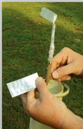
Scion wood from a female persimmon tree (the part wrapped in grafting tape) has been bark-grafted onto this male persimmon sapling, effectively cloning the fruit-producing female.

Place the packaged scions in a refrigerator with the thermostat set at 32-38° F. You don't want the scions to freeze solid, but you also don't want them to get warm enough for bud activation. It is critical that your scions don't come into long-term contact with ethylene gas while in storage. Many fruits and vegetables release ethylene gas and, when stored in a refrigerator with grafting scions, can severely damage a scion's buds. Apples, apricots, avocados, peaches and nectarines, pears, and tomatoes release large amounts of ethylene when ripening and should never be stored in the same refrigerator as your scions.